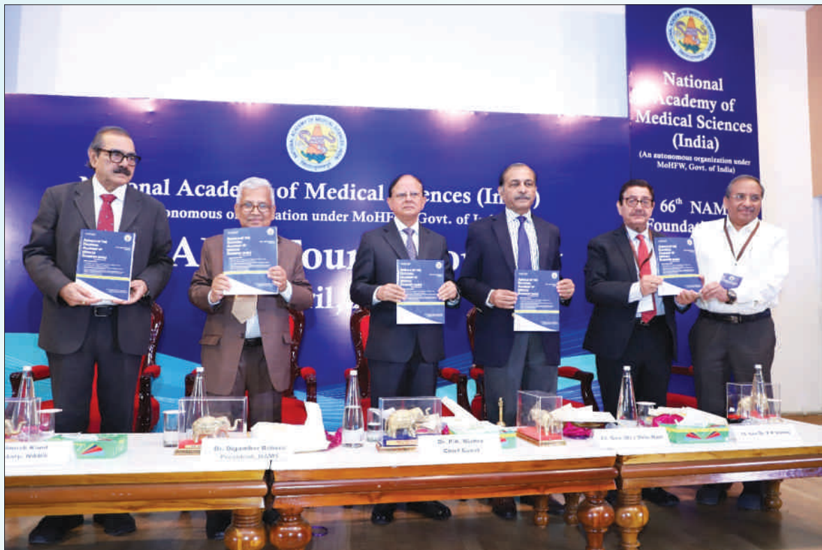
Release of NAMS Annals