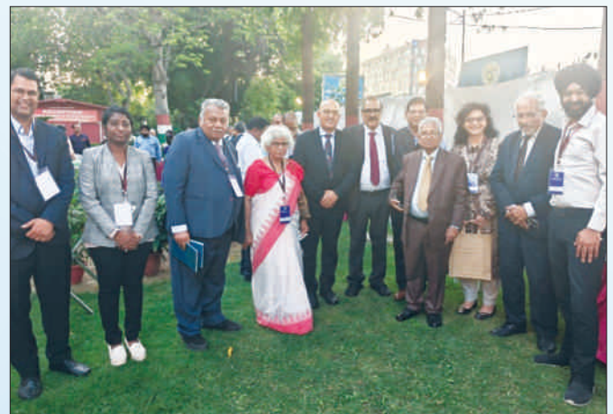
NAMS Family Members