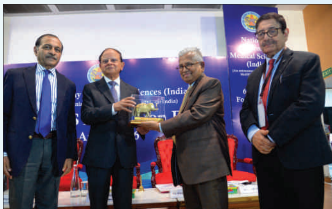
Felicitation of Hon'ble Chief Guest