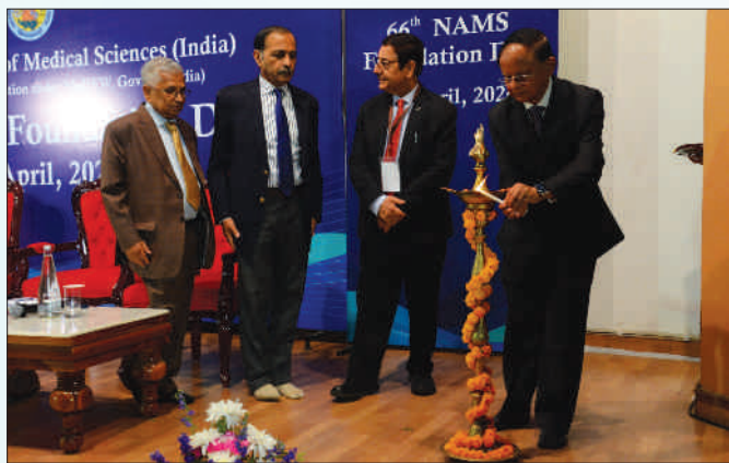
Lamp Lighting Ceremony by Hon'ble Chief Guest