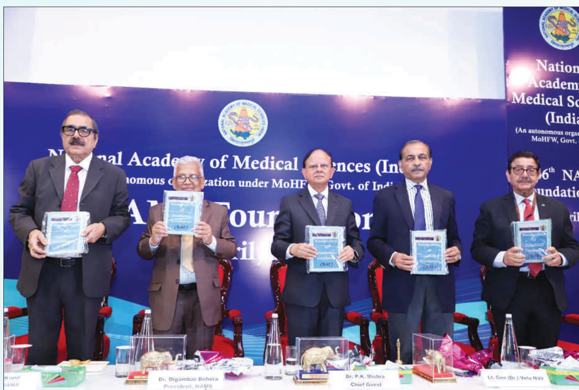
Release of RAE booklet