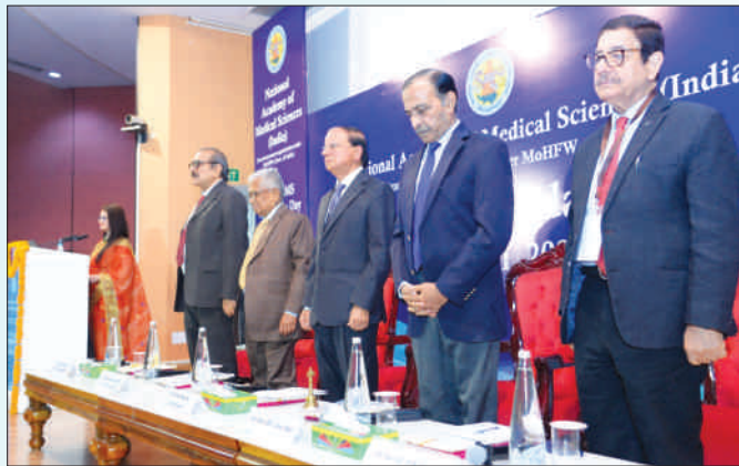
Vande Matram Recital